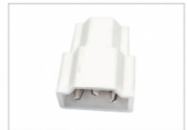
End to end connector