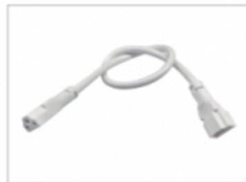
12in extension cable