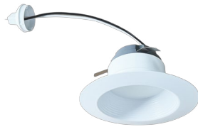
LS-LV4-5CCT-BF-WH 4" 12V 5CCT Baffle, White