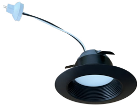
LS-LV4-5CCT-BF-BL 4" 12V 5CCT Baffle, Black