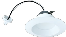
LS-LV4-5CCT-SM-WH 4" 12V 5CCT Smooth, White