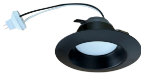
LS-LV4-5CCT-SM-BL 4" 12V 5CCT Smooth, Black