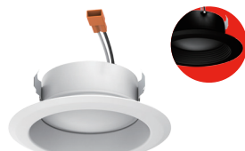
LSF-4"3CCT/SM LSF-4" 3CCT/SM/BK