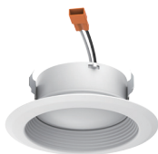
LSF-4"3CCT/BF LSF-4" 3CCT/BF/BK