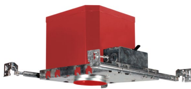
LS-35FR-ICAT 3" Fire Rated New Construction Housing