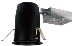
LS-35-R-ICAT 3.5" Remodel Housing