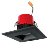
LSRE-3SQS5CCTBL 3" Square Smooth Reflector, Black finish