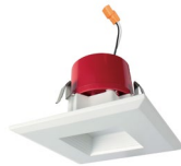
LSRE-3SQB5CCTWH 3" Square Baffle Reflector, White finish