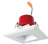
LSE-3SQS5CCTWH 3" Square Smooth Reflector, White finish