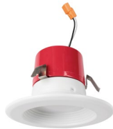
LSRE-3RB5CCTWH 3" Baffle Reflector, White finish