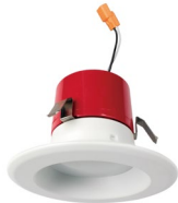
LSRE-3RS5CCTWH 3" Smooth Reflector, White finish