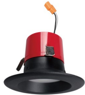
LSRE-3RS5CCTBL 3" Smooth Reflector, Black finish