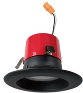
LSRE-3RB5CCTBL 3" Baffle Reflector, Black finish