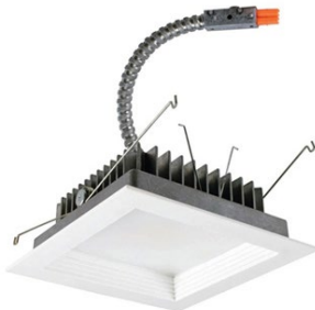
LSL-5-SQ-503 5" Dedicated CCT Square Baffle LED Recessed Downlight