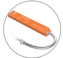
EM-15W Optional Emergency Battery Backup