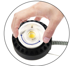
Twist lens to change beam angle output