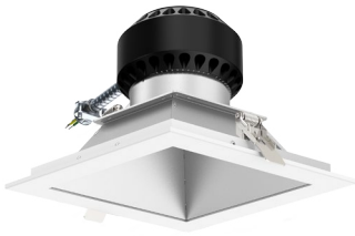
Wattage Tunable Switch