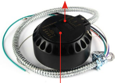
5CCT Selectable Switch