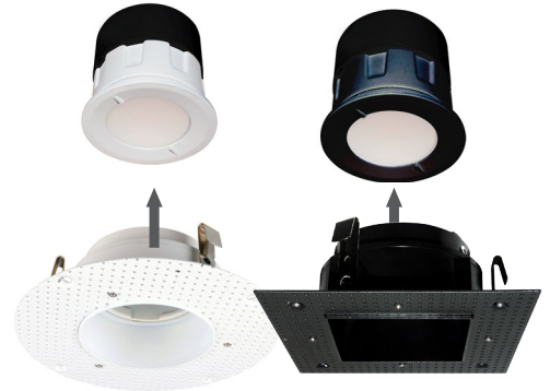
Mud Ring available in Round & Square Sold Separately