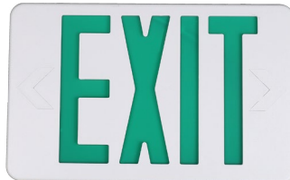
LS-EXX-G LED Exit Sign, Green Letters