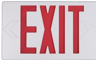
LS-EXX-R LED Exit Sign, Red Letters