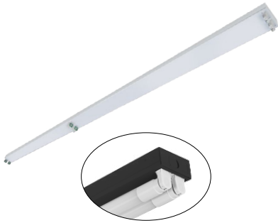
Shown with (2) T8 Tubes