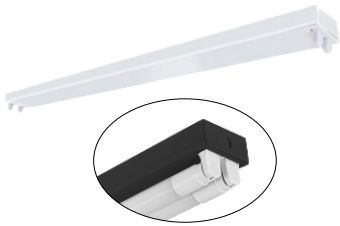
Shown with (2) T8 Tubes

4ft. Double End Wired Strip Fixture - Use with Two (2) T8 Lamps