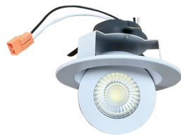
LS-4-ADJ-5CCT-WH 4" 120V 5CCT Adjustable Gimbal, White