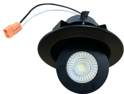
LS-4-ADJ-5CCT-BL 4" 120V 5CCT Adjustable Gimbal, Black