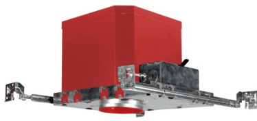
LS-3NFR-ICAT 3" Fire Rated New Construction Housing