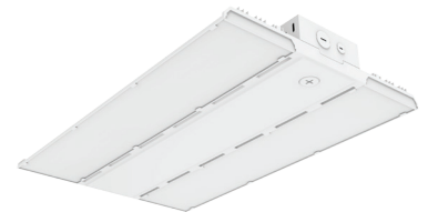
LSCI-HB18WT3CCT 1.5FT. Linear