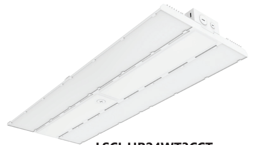
LSCI-HB24WT3CCT 2FT. Linear