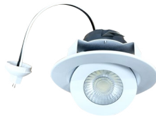
LS-LV4-ADJ-5CCT-WH 4" 12V 5CCT Adjustable Gimbal, White