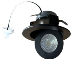
LS-LV4-ADJ-5CCT-BL 4" 12V 5CCT Adjustable Gimbal, Black