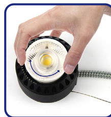
TWIST LENS Easy adjustable beam angle output