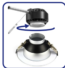
TWIST-ON for easy installation