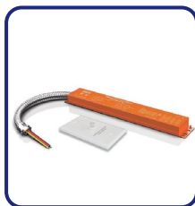
EMERGENCY add on option