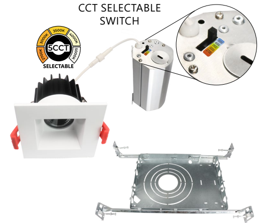
LS-UNV-H234 Universal New Construction Frame-in

1" & 2" 5CCT Regress LED module is IC rated aluminum die-cast with two tension spring clips. Used in conjunction with compatible driver box and interchangeable trims.